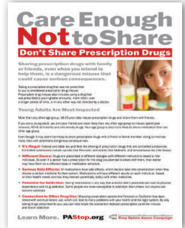
Informational One Sheet