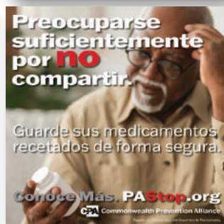
Visual assets for Social Media posts (Spanish language and multiple sizes also available)

SCAN THIS CODE to access and download all PAStop messaging resources.