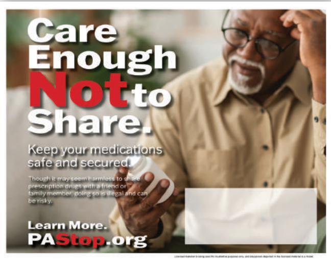
8.5" X 11" Flyers for Office or Local Printing (4 message options available)