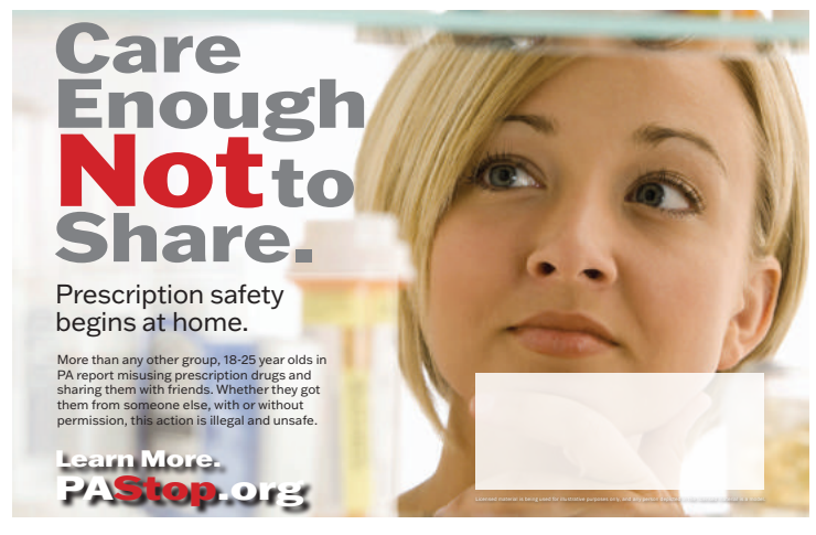
11" X 17" Posters for Office or Local Printing (4 message options available)

CLICK on any of the following previews for instant FREE downloads!