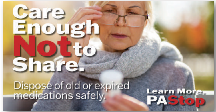
Digital display for advertising (Multiple sizes available)